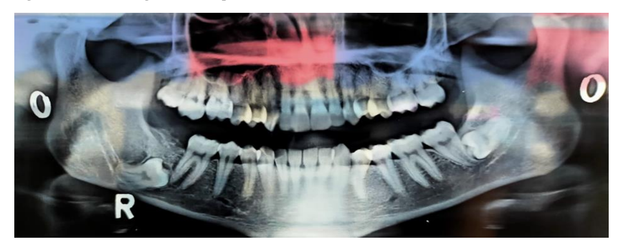
Figure-1: OPG Showing Bilateral Impacted Molars (34 &47)

We present a case of 23-year-old female patient, who consults with the Maxillofacial surgery department due to pain in the back side of lower jaw bilaterally since a month. Patient was otherwise healthy with no past medical or dental history. On clinical examination, patient had pericoronitis in relation to 47 which was reddish in colour and tender on palpation. No restriction in the mouth opening was noticed. The orthopantomogram was revealed horizontally impacted mandibular 2<sup>nd</sup> molar on right and 3<sup>rd</sup> molar in left side.