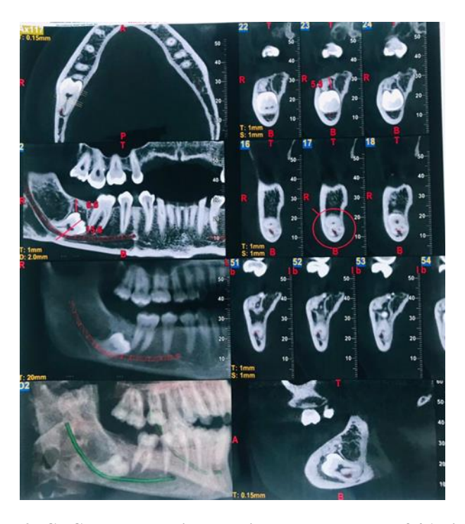
Figure-2: CBCT scan showing relation between roots of 46 with 47.

A Cone beam CT was also performed to check the relationship of impacted mandibular 2<sup>nd</sup> molar with inferior alveolar canal. CBCT showed the evidence of narrowing of the canal on right side with no gap between the inferior alveolar canal and roots of impacted 47 while on left side there was a distance of just 0.1mm between roots of 38 and inferior alveolar canal.