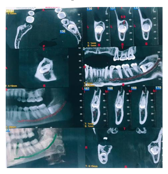
Figure 3: CBCT scan showing relation between IAN and 38,