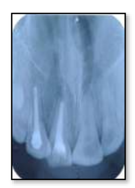
Figure 7: 12-months follow up