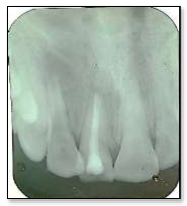
Figure 3: Biomechanical preparation with Calcium hydroxide placement

https://doi.org/10.56501/intjpedorehab.v7i2.504