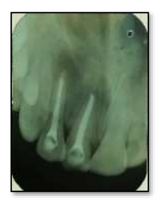
Figure 4: Post operative - IOPAR