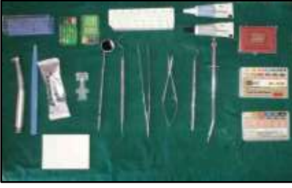
Figure 15: Armamentarium

Biodentine was prepared according to the manufacturer's instructions. It was carried into the canal with an amalgam carrier and condensed with hand pluggers to form apical plug of 5 mm in thickness [Figure 16], [Figure 17]. The excess material from the walls was removed with paper points, and after 12 minutes, the rest of the canal was obturated with gutta-percha and seal apex sealer is original non-eugenol, calcium hydroxide polymeric root canal sealer (Kerr, Balz, Italy). The access cavity was closed temporarily with glass ionomer [Figure 18]. After 1 week, the glass ionomer was replaced by a bonded resin restoration (Filtek Z350XT; 3M ESPE Dental Products, St Paul, MN).