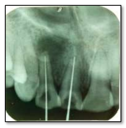
Figure 2: Working length determination in 11,12

Radiographically, the tooth exhibited incomplete root formation, characterized by blunderbuss canal and an associated periapical lesion with the same [Figure 2]