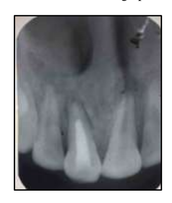
Figure 18: 3-, 6- and 12-months follow-up

https://doi.org/10.56501/intjpedorehab.v7i2.504