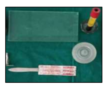
Figure 13: Platelet Rich Fibrinogen