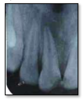
Figure 9: Blunderbuss canal

A periapical radiograph of the tooth showed that the coronal fracture appeared to reach the mesial pulp horn of tooth, and marked radiolucency was observed at the periapical area of the root. The root apex was not fully formed [Figure 9] . The revascularization treatment was explained to the patient's parents, and the decision of revascularization was made primarily because the diameter of the open apex was more than 2 mm [Figure 10] .