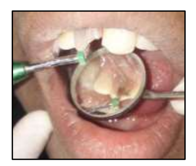
Figure 14: PRF Placement