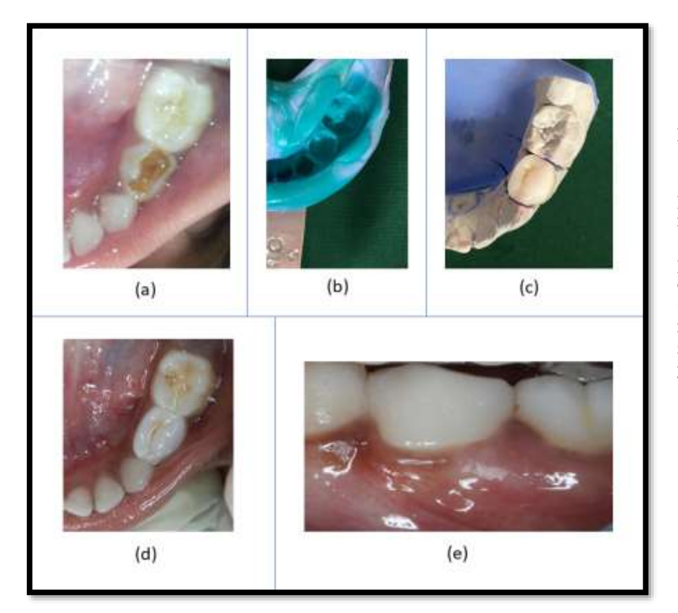
Figure 3 shows: (a): deep carious lesion in 74 (b) & (c): fabrication of personalized zirconia crown in 74 (d): occlusal view showing perfect adaptation of the customized crown in 74 (e): excellent marginal integrity of customized zirconia crown in 74 after 1-year follow-up