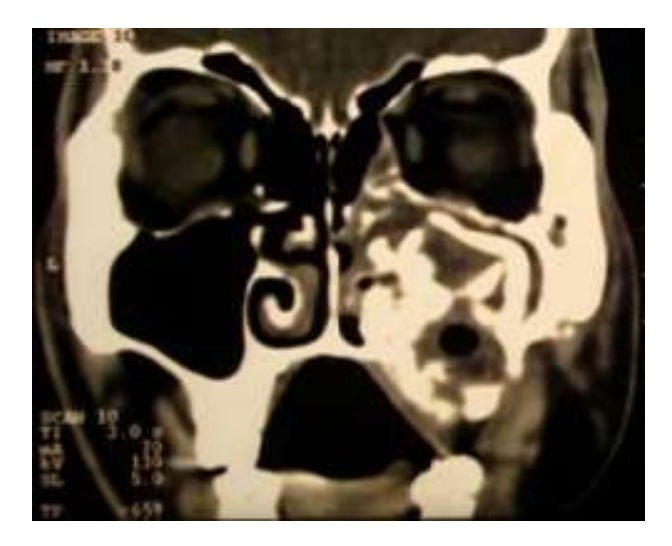
Figure 2: shows an computed tomography image of patient which suggested a fibro-osseous mass of 3.2 X 3 X 4.3 cm in right maxillary sinus having peripheral calcification and central soft tissue attenuation.

The mass has caused obstruction of left infundibulum as well as destruction of medial and inferior wall of right maxillary sinus. A provisional diagnosis of fibro osseous lesion or odontogenic tumor was made and the patient was referred to department of otolaryngology for opinion and treatment options. After interdisciplinary discussions an antroscopy was performed and biopsy tissue was derived. The tissue was embedded in paraffin blocks and routine H&E staining done which revealed epithelioid osteoblast, scanty fibrous tissue and large areas of osteoid. These histological features were suggestive of osteoblastoma. Definitive surgery was planned but resection limits had to be carefully selected. The patient was put under general anesthesia, lip splitting Weber Ferguson incision given and partial infrastructure maxillectomy done, preserving the premaxilla. Before giving palatal cut, pericoronal incision of palatal gingiva was given and a mucoperiosteal flap elevated over bone to allow the palatal mucosa to form future functioning palate on the operated side. The level of resection was at a plane above inferior turbinate.