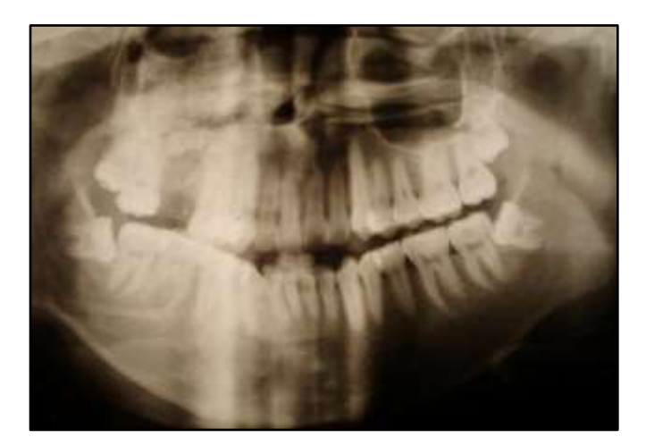
Figure 1: OPG shows an ill defined mixed radio opaque and radiolucent endophytic lesion in right maxilla. The lesion extended from the right canine to the third molar tooth obliterating part of the maxillary sinus superiorly.

A seventeen year old male patient reported to the dental outdoor with the chief complaint of a palatal bulge and pain in his upper jaw for the last one and half month. On examination a firm mass was palpated in relation to upper right maxillary molars having indistinct borders which have caused moderate expansion of both buccal and lingual cortical plates. The right upper permanent first molar tooth was extracted by a local dentist in an attempt to relieve the pain. Remainder of the dental examination was within normal limits. The patient was advised an orthopantomogram which showed an ill defined mixed radio opaque and radiolucent endophytic lesion in right maxilla (As shown in figure 1).