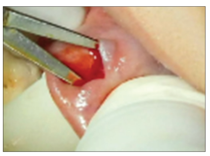
Figure 2: Tissue being separated after local anesthesia.

After local anesthesia, superficial incision was placed over the lesion involving the superficial layers. Tissue was then separated on either side [Figure 2] and the lesion was excised [Figure 3]. Minor salivary glands around the lesion were also excised to prevent recurrence. The tissues were sutured using 4-0 silk suture [Figure 4]. The excised tissue was submitted to the pathological investigations which confirmed the diagnosis and ruled out the minor salivary gland tumors. The patient was recalled after 1 week for suture removal [Figure 5] and was regularly reviewed at 3-month interval for more than 24 months [Figure 6] and no recurrence was noted.