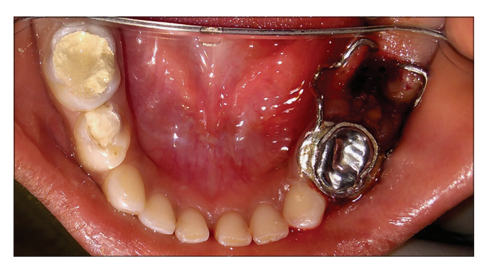
Figure 6: Modified design of distal shoe space maintainer cemented on 84.