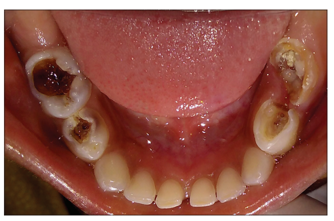
Figure 4: Grossly decayed 85 in a 5-year-old patient, indicated for extraction followed by distal shoe space maintainer.