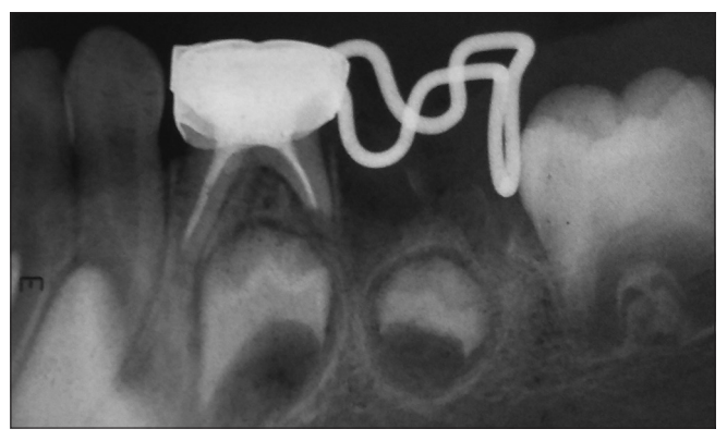
Figure 7: Radiograph immediately after cementation of the modified distal shoe space maintainer.