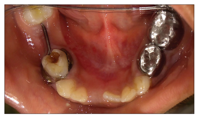
Figure 3: Broken horizontal arm of Willet's design, dislodgment of restoration with 74.