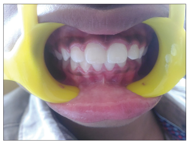
Figure 4: Well-aligned anterior teeth in straight lip type.