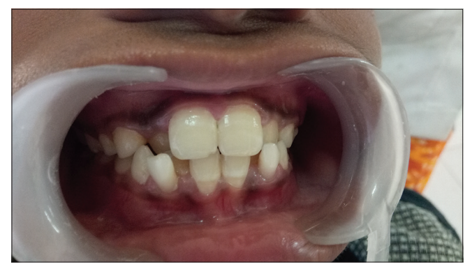
Figure 6: Malaligned anterior teeth in highly arched lip type.