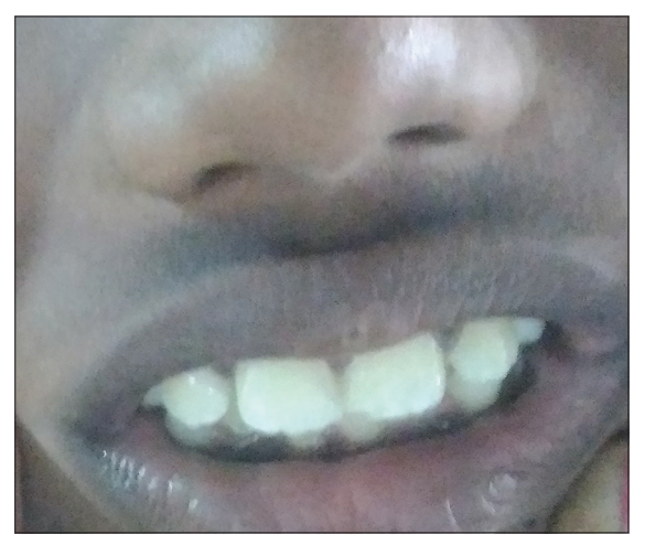
Figure 5: Increased overjet of anterior teeth in moderately arched lip type.