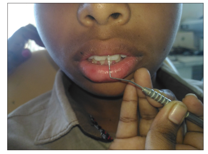
Figure 3: Highly arched type of lip form.