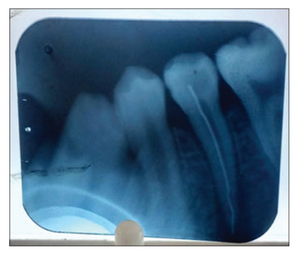
Figure 2: Premolar with radioopaque object.

McAuliffe et al. <sup>[15]</sup> summarized various radiographic methods such as the parallax views, vertex occlusal view, triangulation techniques, stereoradiography, and tomography to be followed to localize a radiopaque foreign object. The parallax technique involves two radiographs taken at different horizontal angles with the same vertical direction. Due to parallax effect, the objects appear to travel in the same direction as the tube shifts and the object closer to the tube appears to move in the opposite direction (the so-called same-lingual,