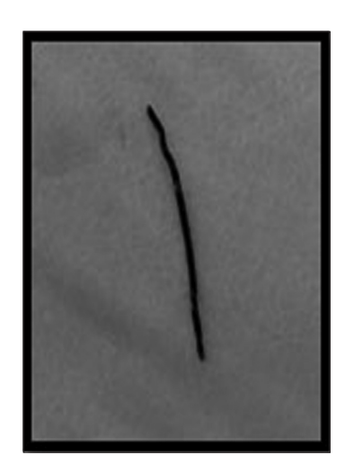
Figure 3: Rusted sewing needle.

Foreign objects lodged in the root canal can be classified into metallic and nonmetallic objects. Because of their radiopaque nature, the metallic objects can be readily identified from routine radiographs. Hunter and Taljanovic<sup>[14]</sup> summarized various radiographic methods to be followed to localize a radiopaque foreign object as parallax views, vertex occlusal views, triangulation techniques, stereoradiography, and tomography. The visibility of different materials on plain radiographs depends on their ability to attenuate X-rays; foreign bodies may be visualized, depending on their inherent radiodensity and proximity with the tissue in which they are embedded.<sup>[12]</sup>