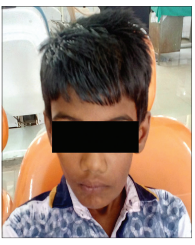
Figure 1: Patient with extraoral swelling.

Different types of foreign objects are reported to be lodged in the root canals and the pulp chamber ranging from pencil leads,<sup>[10]</sup> darning needles,<sup>[11]</sup> and metal screws<sup>[12]</sup> to beads<sup>[2]</sup> and stapler pins.<sup>[8,9]</sup> Harris<sup>[13]</sup> reported the placement of varied objects within the root canals of maxillary anterior teeth. These included pins, wooden toothpicks, a pencil tip, plastic objects, toothbrush bristles, and crayons. The patients had inserted these objects in the root canal to remove food plugs from the teeth.