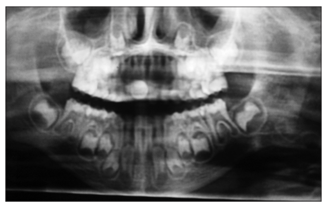
Figure 7: Radiographic appearance of dentition in orthopantomogram.