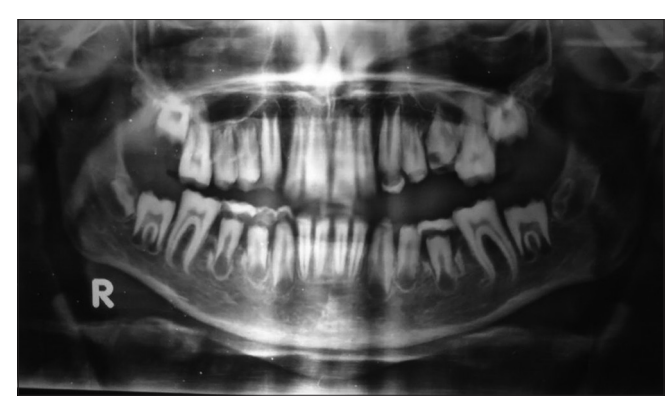
Figure 2: Orthopantomogram of the dentition.