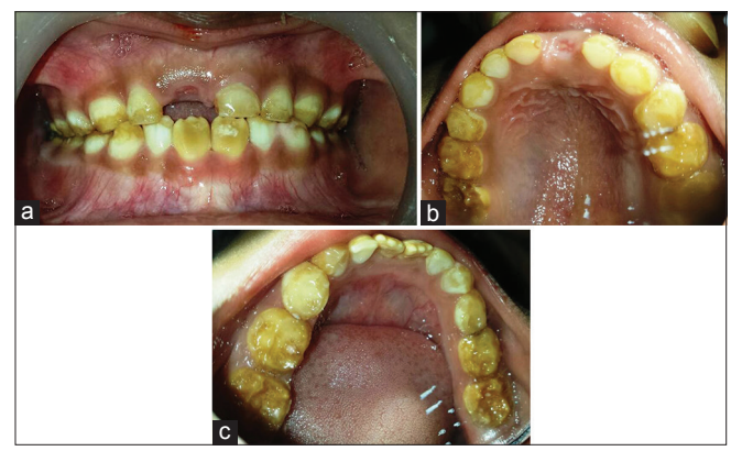
Figure 6: (a) Preoperative view (b) Preoperative view of maxillary arch (occlusal view) (c) Preoperative view of mandibular arch (occlusal view).