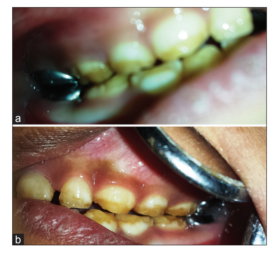
Figure 9: (a) Postoperative view showing posteriors in occlusion (right side) (b) Postoperative view showing posteriors in occlusion (left side).