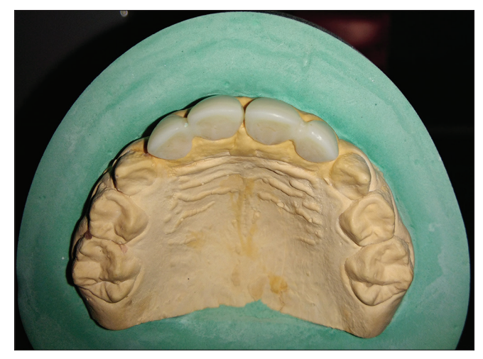
Figure 8: Heat cure acrylic crowns fabricated with good quality of finishing and polishing on 51, 52, 61, 62 lingual view.

Esthetic restorations in primary anterior teeth have been a great concern and challenging task for most of the clinicians. The