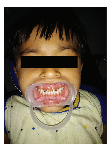
Figure 1: Extensively decayed maxillary anteriors with poor aesthetics.