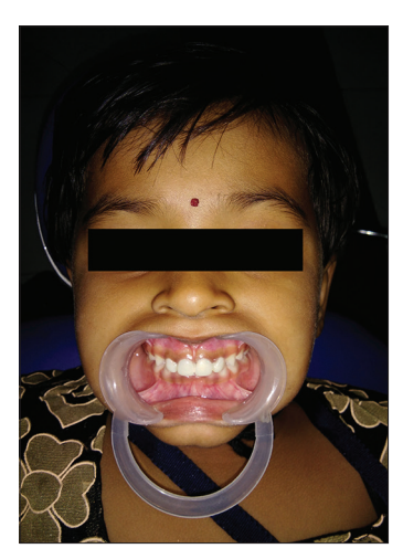
Figure 9: Acrylic crown cemented on 51, 52, 61, 62 extraoral frontal view.

Pulpectomy was carried out in 51, 52, 61, and 62 and precaution was taken that obturation terminates 2–2.5 mm below the cementoenamel junction radiographically. Intracanal acid etching with 37% phosphoric acid was carried out. After drying, the bonding agent was applied and cured. The composite build-up was carried out from intracanal prepared space. 3 to 4 mm composite build up was done above free gingival margin. [6]