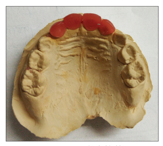
Figure 5: Wax pattern fabricated on 51, 52, 61, 62 palatal/lingual view.

affected teeth. The patient was carefully assessed according to the parameters required for restoration using the acrylic crown. Once the parameters were found to be satisfactory, it was decided to restore the teeth with acrylic crowns.