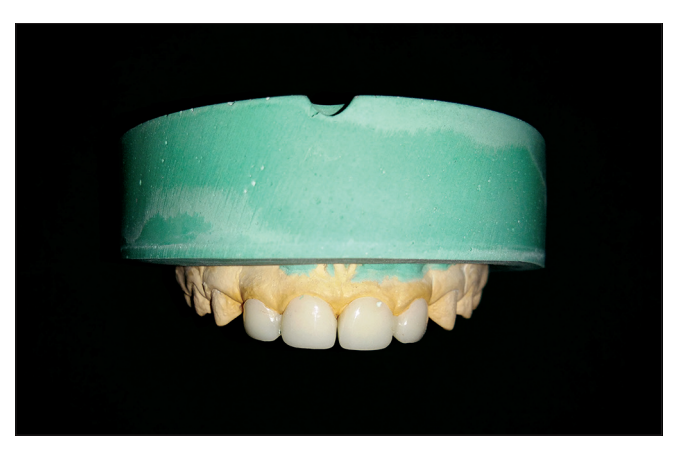
Figure 7: Heat cure acrylic crowns fabricated with good quality of finishing and polishing on 51, 52, 61, 62 frontal view.