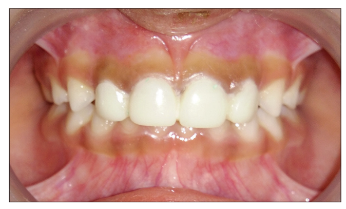
Figure 10: Acrylic crown cemented on 51, 52, 61, 62 close up frontal view.

restoration of carious, fractured, or discolored primary incisors is rewarding to dentists because it gives them the satisfaction of knowing they have restored the smile and self-confidence of a growing child. However, restoring primary teeth can be a strenuous task because of the difficulty in keeping these patients teeth dry and the uncooperative behavior of the child.