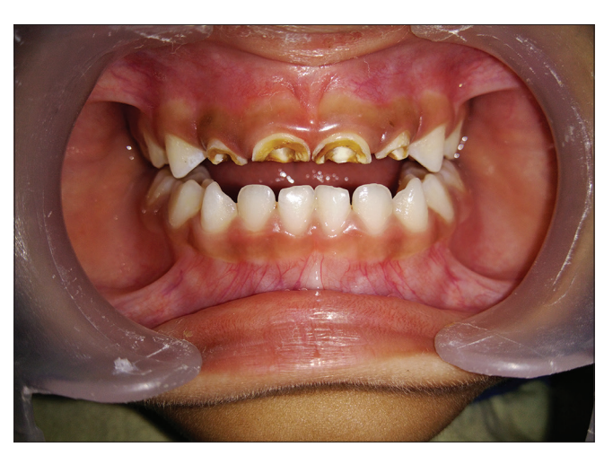
Figure 2: Extensively decayed maxillary anteriors with 1–1.5 mm tooth structure available above the gingival margin.

affected teeth. The patient was carefully assessed according to the parameters required for restoration using the acrylic crown. Once the parameters were found to be satisfactory, it was decided to restore the teeth with acrylic crowns.