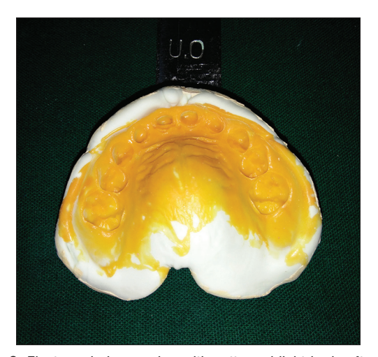
Figure 3: Elastomeric impression with putty and light body after short postcomposite build up on 51, 52, 61, 62.