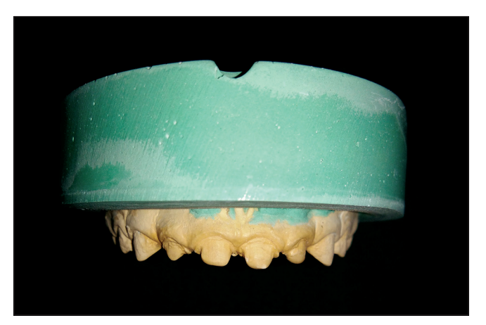
Figure 6: Frontal view of cast without wax pattern or crowns with composite build up on 51, 52, 61, 62.

A thorough assessment of the case was carried out with regards to availability of crown structure, and it was confirmed that at least 1–1.5 mm tooth structure was available above the gingival margin [Figure 2]. There was sufficient clearance with respect to overjet and bite.