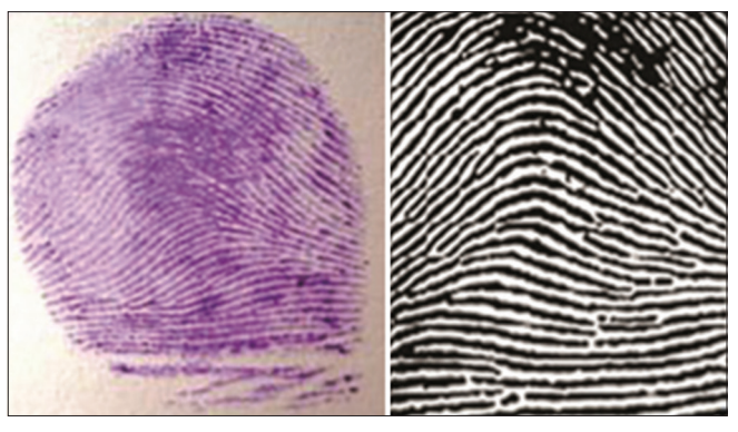
Figure 3: Arch pattern – impression and diagrammatic representation.

The diagnostic value of dermatoglyphic pattern in chromosomal and genetic disorders was first suggested by Czech doctor Jan Purkinjie.<sup>[7]</sup> He suggested that the dermatoglyphic patterns might have both genetic and diagnostic importance. Danuta Loesch<sup>[7]</sup> noted that the diagnostic application of dermatoglyphics should be confined to chromosomal