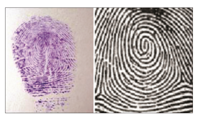
Figure 1: Whorl pattern – impression and diagrammatic representation.

The data collected were subjected to statistical analysis. Chi-square test was used to determine the comparisons between caries and the caries-free groups among special and normal children using SPSS Software version 13 (IBM).