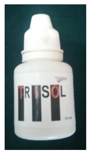
Figure 2: FMC (Kayvee Aero Pharmaceutics) to (Sultan Health care; Inc, Newyork, USA).