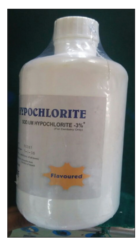
Figure 3: Sodium hypochlorite 5% (Vishal dental care pvt, Gujarat, India).

The clinical and radiographic evaluation was performed at 3 and 6 months follow-up. The clinical success was examined in the absence of spontaneous pain, mobility, swelling, fistula,