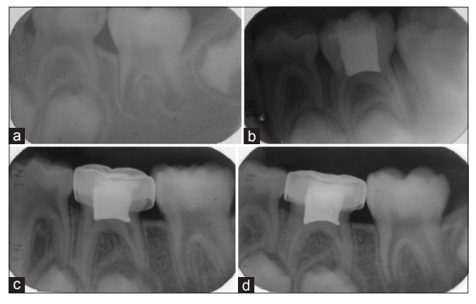
Figure 4: Formolcresol group: (a) Preoperative photograph, (b) postoperative photograph, (c) 3 months follow-up, (d) 6 months follow-up.