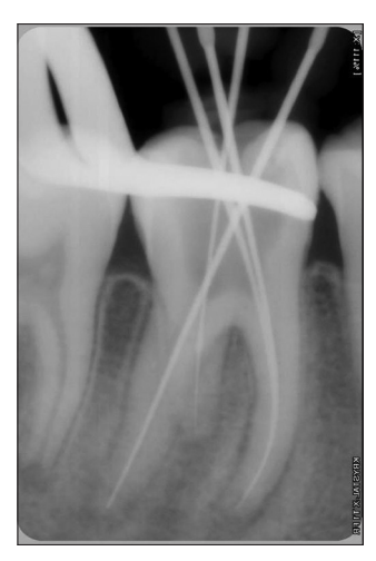
Figure 4: Working length determination.