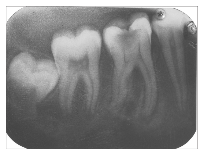
Figure 1: Preoperative radiograph.