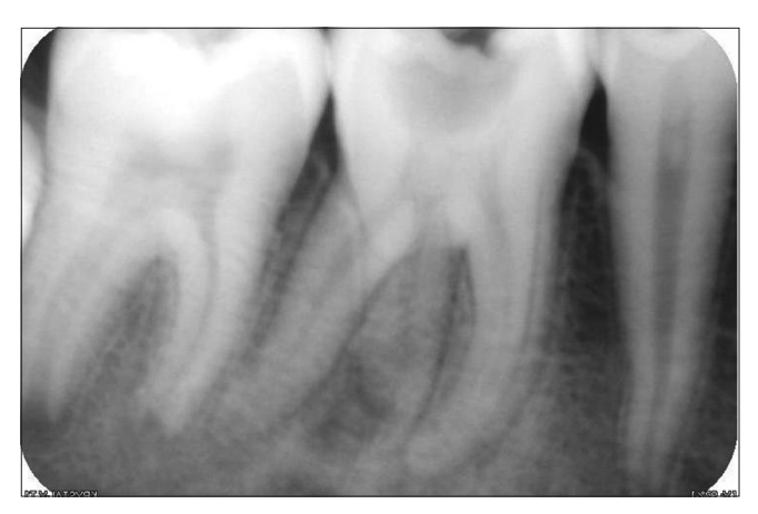
Figure 2: Preoperative radiograph taken at 20° angulation showing radix entomolaris.