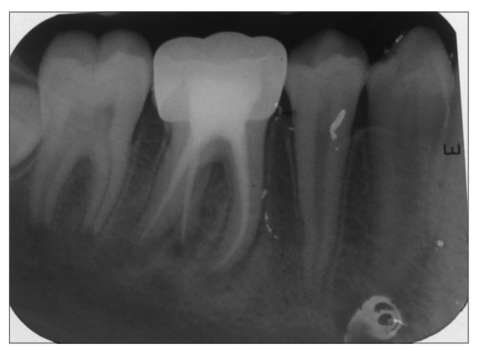
Figure 6: Obturation and stainless steel crown placement.

the root canal morphology have to be well-appreciated by the pediatric dentist along with the endodontist. It is imperative that the clinician be well informed and alerted to the commonest possible variations during endodontic procedure. The initial