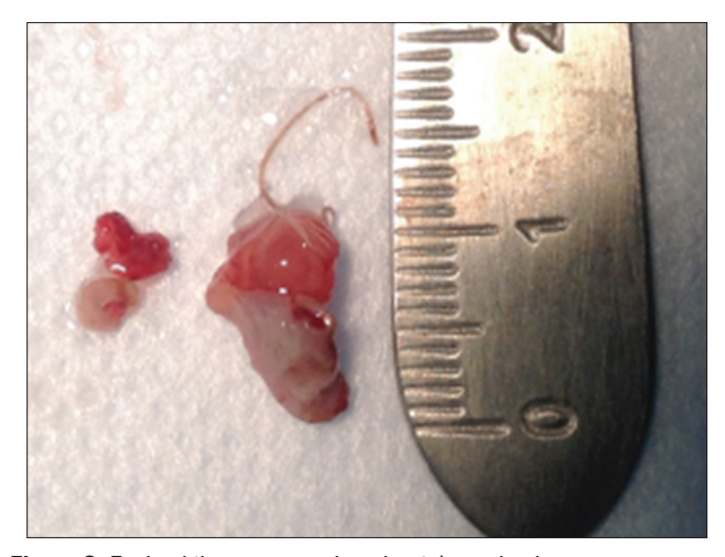
Figure 2: Excised tissue measuring about 1 cm in size.

Mucoceles have no age predilection, but many occur in children and young adults due to more chances of trauma. The lower lip is reported to be the most common site as the maxillary canine impinges on it. Various works of literature on the mucocele reveal that it is equally seen in men and women