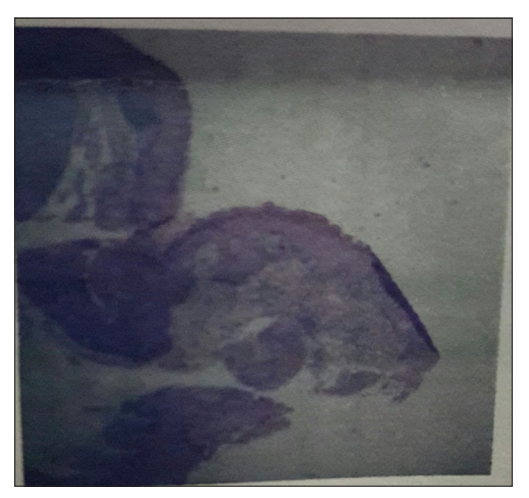
Figure 3: Histopathological examination.