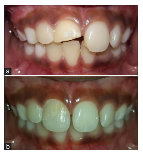
Figure 4: Intraoral view showing correction of crossbite (a) and composite build-up of maxillary central incisors (b).