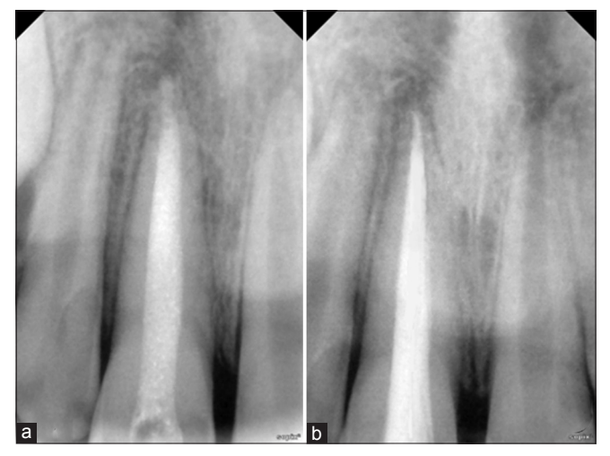
Figure 2: Radiovisiography showing calcium hydroxide (a) and final gutta-percha obturation (b) for the maxillary right central incisor.

were made, and the casts were obtained. The appliance was fabricated using autopolymerizing resin (DPI-RR, Cold Cure, Bombay Burmah Trading Corporation Ltd., Mumbai, India) and the components included right single finger spring for MRCI, Z-spring for MRLI, a short labial bow, and Adams clasps using 23, 23, 21, and 21-gauge stainless steel wires, respectively, along with a posterior bite plane. After the insertion of the appliance, the finger spring was activated, while the Z-spring remained passive during the first and second visits [Figure 3a]. During the third visit, the finger spring was removed followed by the activation of Z-spring [Figure 3b]. Each appointment interval ranged from 15 to 20 days. During the fourth visit, the crossbite correction of MRLI was observed [Figure 4a] and the appliance was discontinued with subsequent obturation of MRCI with gutta-percha [Figure 2b] followed by composite build-up (Tetric® N-Ceram, Ivoclar Vivadent Marketing [India] Pvt. Ltd., Mumbai, India) to MRCI and MLCI [Figure 4b]. The total treatment time taken was 3 months for the closure of the apex of MRCI and correction of midline diastema and crossbite.