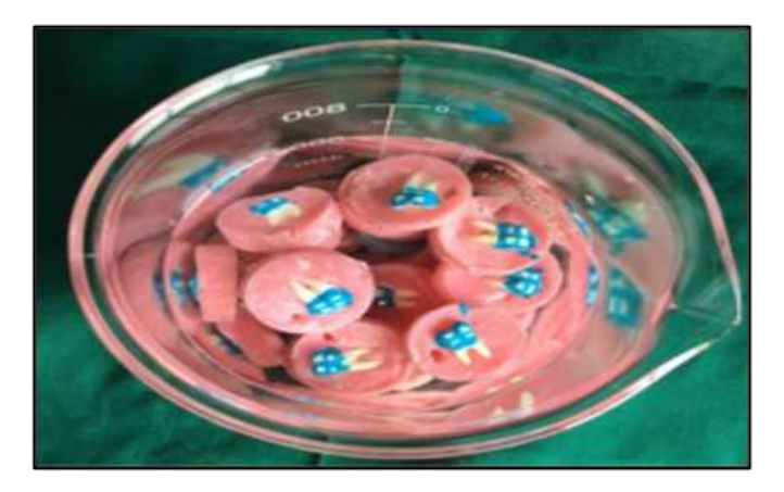
Figure 2 shows samples immersed in demineralizing solution

The demineralization process : The solution of pH 4 was created using MKOH, CaCl2 2H2O, KH2PO4, and acetic acid. A homogeneous white spot lesion was produced on the window's surface after 5 days of soaking the mounted teeth in this solution.