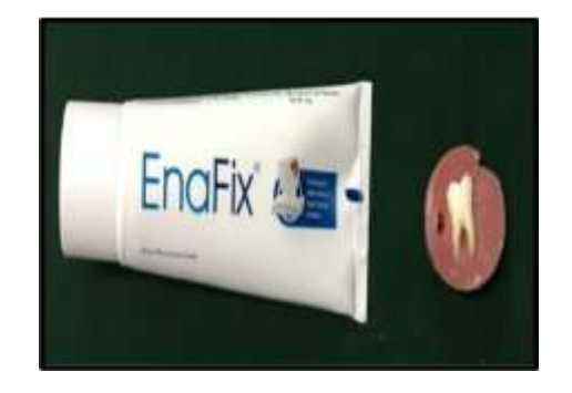
Figure 3 shows group A Tooth Mousse plus and Figure 4 group B Enafix remineralizing agent