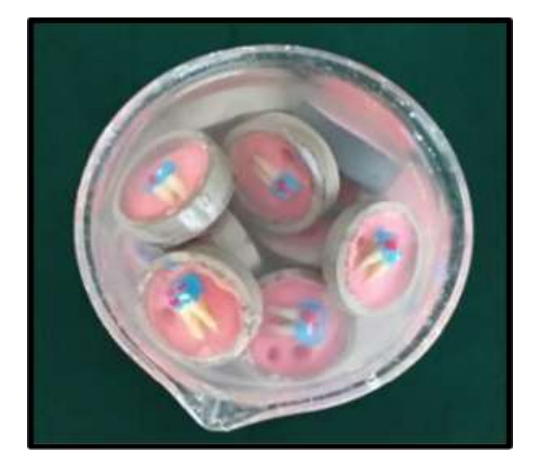
Figure 5 shows samples after application of remineralising agent; sample again were immersed in demineralising solution.

The samples in each group were treated with the respective remineralizing agent that were continuously applied onto the remaining 3 windows of the tooth surface with the help of a disposable cotton applicator tip for 3 minutes once in every 24 hours for a period of 4weeks. Samples after application of the remineralizing agents were then washed with deionized water and then placed in artificial saliva, that was changed once in every 24 hours until the final acid challenge. Remineralization process was continued for a period of 2 weeks and the second window was coated with acid resistant nail varnish, the remaining two windows were continued remineralization and the third window was closed after a period of 4 weeks. After these times, the samples were once more submerged for five days in the demineralizing solution previously described in order to test the treated surfaces' acid resistance. The fourth window was then painted with acid-resistant nail polish.