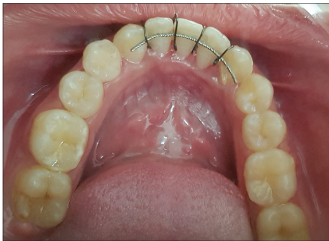
Figure 2: "V" clip in position holding the retainer before bonding