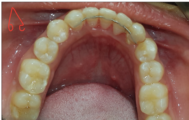
Figure 3: Bonding done ævæ clips removed

Moreover, then the wire is extended to the incisal area and bended linguallly. Markings are done at the area where the fixed lingual retainer is to be given, and round bend facing to the lingual embrasure area is given so that the lingual retainer wire is hold at the desired level by this "V" Retainer clip.