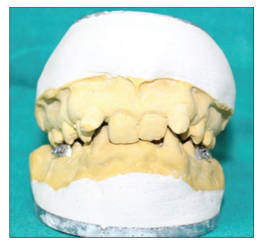
Figure 1: Casts mounted on hinge articulator for fabrication of "tempo blocks"