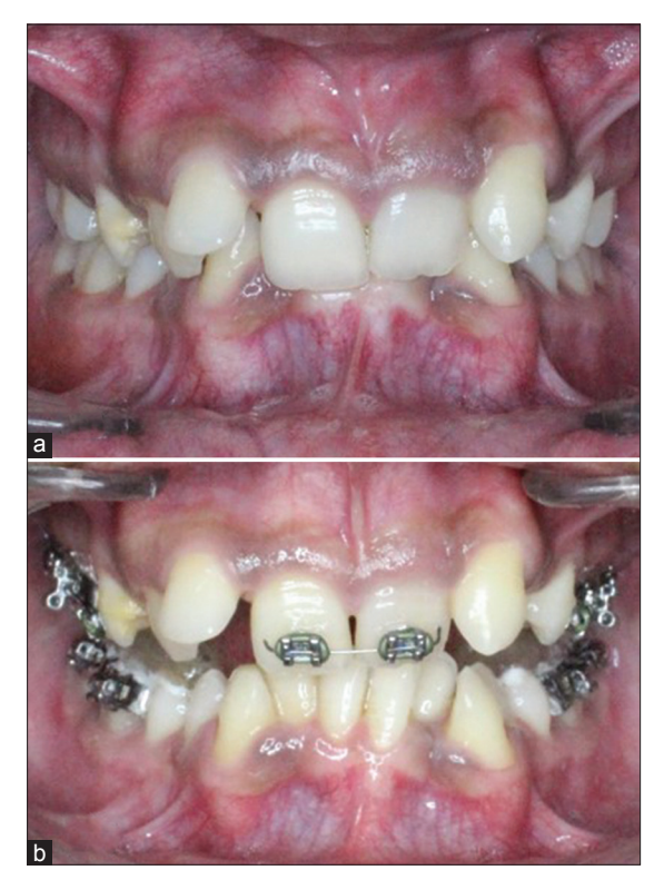
Figure 5: (a and b) "Tempo blocks" for opening bite in case of 100% deep bite malocclusion