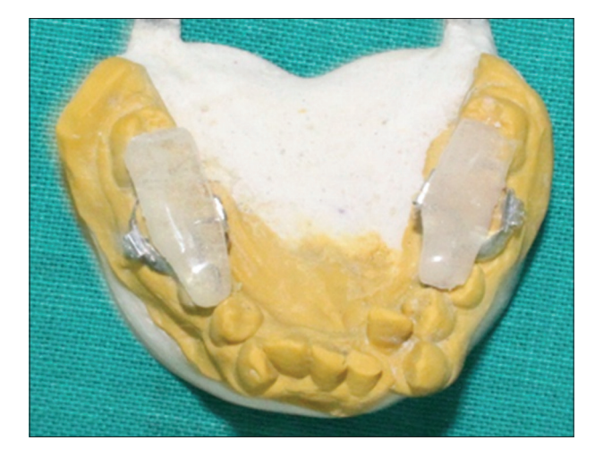
Figure 3: "Tempo blocks"