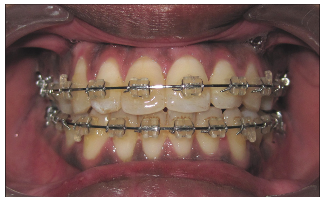
Figure 2: Mid-treatment intraoral photograph

The preadjusted edgewise appliance with 0.022" McLaughlin, Bennett, Trevisi prescription was used. The lower incisor