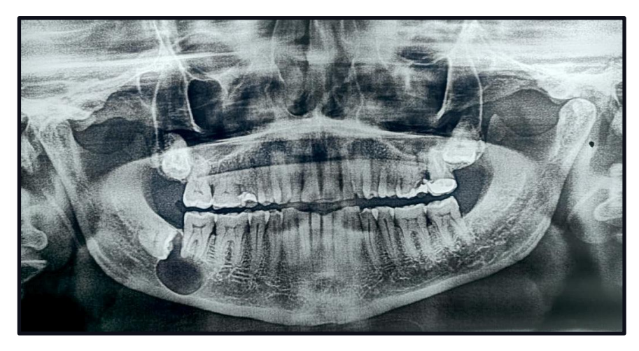
FIGURE 1: Indicates the unilocular well-defined corticated radiolucency noted with horizontally impacted 48 extending from the coronal surface of 48 up to the root of 47 regions.

Based on history, clinical and radiographic examination, a differential diagnosis of dentigerous cyst, OKC, and Unicystic ameloblastoma was suggested. After getting an informed consent signature from the patient surgery was performed to remove the lesion. Under general anesthesia, surgical enucleation of the cystic area was done along with the extraction of the impacted tooth. Excised specimens were submitted to the Department of Oral and Maxillofacial Pathology for providing a correct diagnosis. (Figure 2)