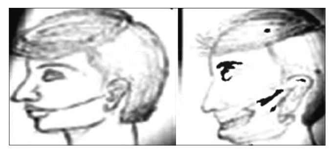
Figure 2: Incision given from the angle of the mouth to tragus of the ear and flap is reflectedf

The virtual autopsy can be applied in a broad number of forensic situations, such as thanatological investigations, carbonized and putrefied body identifications, mass disaster cases, age estimation, anthropological examinations, and skin lesion analyses [Figure 3].