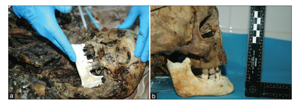
Figure 4: (a and b) Human dehydrated mandible and skull found along the coast of Valderice, in the province of Trapani, Italy. Perfect occlusion match can be observed

CARESTM: Computer-assisted recovery enhancement system, FACES: Forensic anthropology computer enhancement system, FFR: Fractional flow reserve