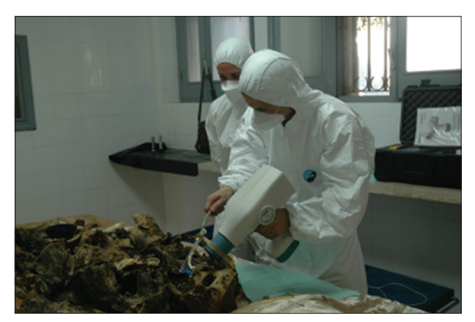
Figure 5: The portable radiographic unit (Nomad Examiner, Aribex Inc., USA) associated with a sensor for digital radiography

performed during the previous autopsy, to verify the compatibility of the human mandible with the previously examined body, thus integrating the existing profile written by the medical examiner with all those complementary elements which could lead to the identification of the body itself. The body was exhumed, and it underwent a dental and anthropological PM examination. To compile a forensic odontological profile, the following examinations were performed: A complete radiographic examination of the maxillary and mandibular arches, inspection by and without ultraviolet light (395 nm), photographic examination with and without linear referencing, impressions of the dental arches, sampling of dental enamel and sampling of dental material (composite resin and metal alloy taken from a dental inlay). All the technical examinations were performed in the mortuary of the cemetery in Trapani using the personal equipment of the author, among which, the portable radiographic unit (Nomad Examiner, Aribex Inc., USA), which was associated with a sensor for digital radiography and connected to a laptop [Figure 5 and Table 1].<sup>[27-29]</sup>