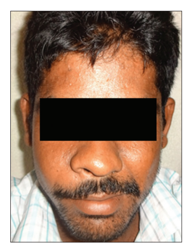
Figure 1: A diffuse swelling of size approximately 3\,\text{cm}\times3\,\text{cm} presents in the right middle-third face

On the basis of history and clinical presentation, a provisional diagnosis of developmental odontogenic cyst most likely odontogenic keratocyst in relation to the right maxilla was given. The differentials included radicular cyst, dentigerous cyst, benign odontogenic tumors such as ameloblastoma and AOT, odontogenic myxoma, reactive lesions such as central giant-cell granuloma, central ossifying fibroma, and malignancies such as central mucoepidermoid carcinoma.