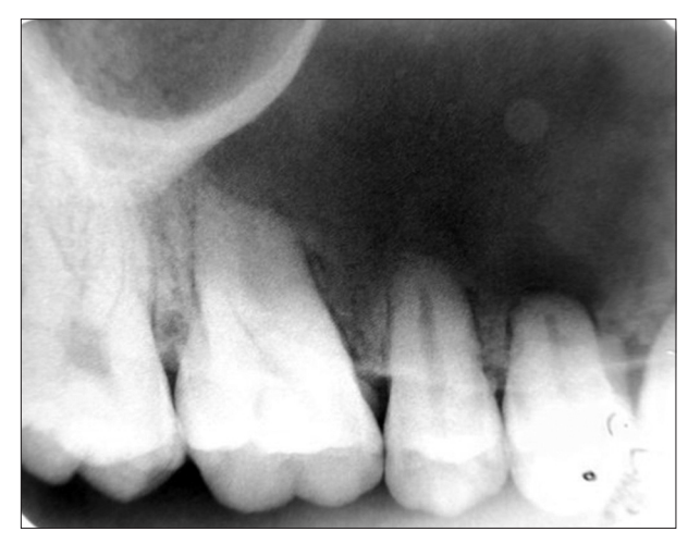
Figure 4: Intraoral periapical radiograph in relation to 13, 14, and 15 reveals a well-defined corticated unilocular homogeneous radiolucency extending from the mesial of 13 to distal of 15 with the displacement of 13 and root resorption in relation to 14 and 15

AOT is a slow-growing lesion, constituting about 3% of all odontogenic tumors followed by odontoma, periapical cemental dysplasia (cementoma), myxoma, and