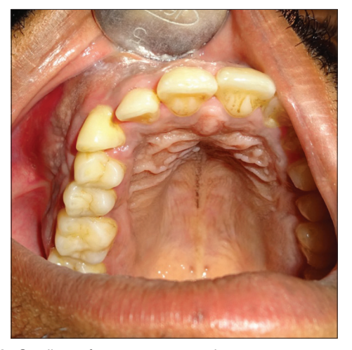
Figure 2: Swelling of size approximately 3 cm \times 3 cm presents in relation to the right maxilla with buccal and palatal expansion