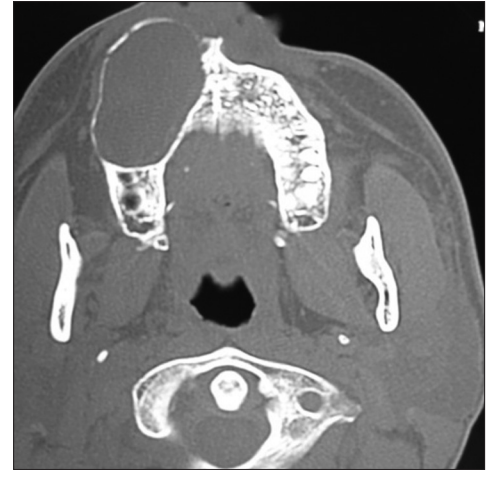
Figure 6: Computed tomogram axial bone window reveals a hypodense area involving the right maxilla with expansion of buccal cortical plate

ameloblastoma. [6] They are largely limited to young patients, and two-thirds of all cases are diagnosed when the patients are 10-19 years of age. This tumor is definitely uncommon in a patient older than 30 years.[1] The tumor is most often diagnosed in the second decade of life, and women are about twice as many affected than men. AOT is over two times more located in the maxilla than in the mandible, and the anterior jaw is much more affected than the posterior area.<sup>[7]</sup> These features are consistent with our present case except the gender variability where we have reported a young male. According to Philipsen and Reichart, [8] AOT appears in three clinicotopographic variants: follicular, extrafollicular, and peripheral. The follicular and extrafollicular variants are both intrabony and account for approximately 96% of all AOTs of which 71% are of follicular type. The tumor is usually associated with unerupted teeth, frequently canines.[9] However, in our case, there were no clinically missing teeth.