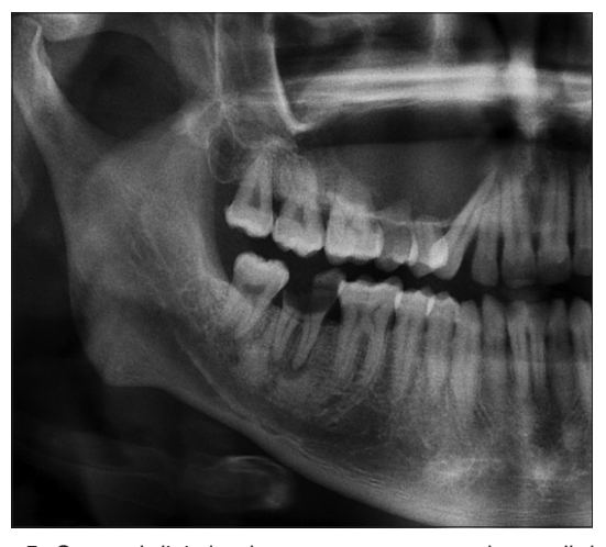
Figure 5: Cropped digital orthopantomogram reveals a well-defined corticated unilocular homogeneous radiolucency extending from the mesial of 11–17 with root resorption in relation to 14, 15, and 16

Thermal and electric vitality test revealed immediate response in relation to 21, delayed response in relation to 11 and 12, and no response in relation to 13, 14, 15, 16, and 17. On lesional aspiration, 5 ml of amber-colored fluid was obtained. Routine hemogram was within normal limits. Excisional biopsy was done, and the specimen was sent for histological investigation. Histologic investigation revealed a well-defined capsule and odontogenic epithelium which appeared in the form of strands and nodules and gives a whorled appearance, and there was calcification in some areas suggestive of AOT [Figure 8].