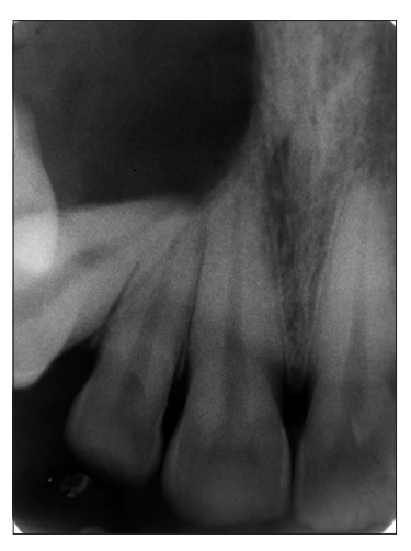
Figure 3: Intraoral periapical radiograph in relation to 11, 12, and 13 revealed a well-defined homogeneous radiolucency extending from the periapical region of 11 to the mesial aspect of 14