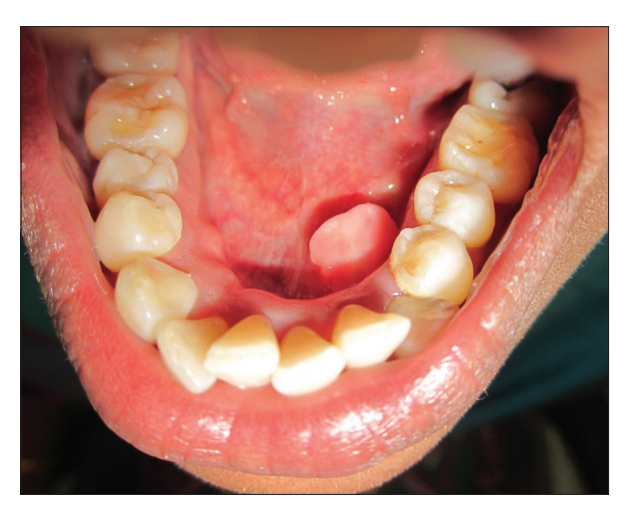
Figure 1: Clinical photograph showing the lesion in the floor of the mouth

submitted for histopathology. The hematoxylin and eosin stained sections showed an unencapsulated tumor mass composed of numerous, irregularly arranged spindle cells consisting of scanty cytoplasm and thin wavy nucleus along with fibroblasts, collagen bundles, few blood vessels, and nerve bundles. There was no evidence of malignancy in the cells. The histopathologic appearance was consistent with NF [Figure 2].