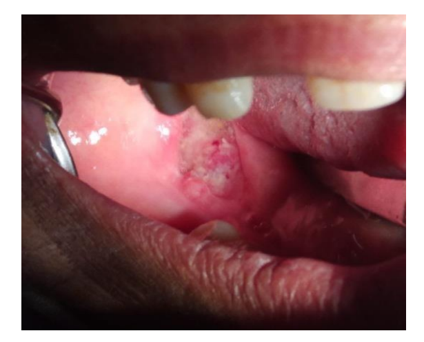
Figure-1: Clinical picture showing ulceroproliferative lesion on right alveolar ridge.

Orthopantomograph revealed a small radiolucency involving 47 and 48 area with infected root stumps of 38. (Figure-2)