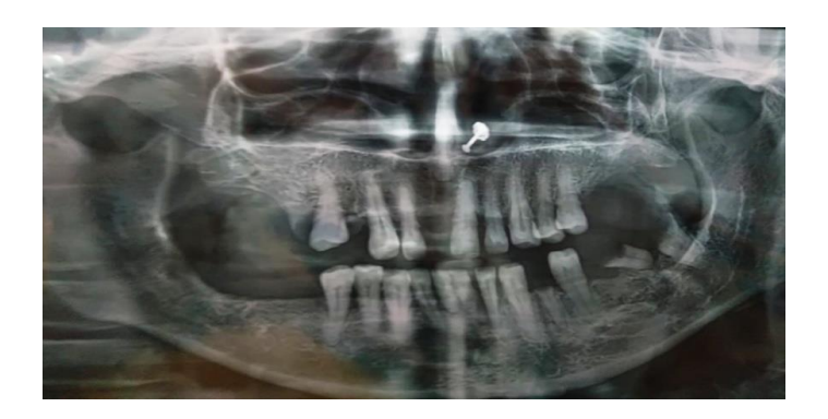
Figure-2 OPG showing partial edentulous mandible with minor radiolucency along the right alveolar ridge.

Orthopantomograph revealed a small radiolucency involving 47 and 48 area with infected root stumps of 38. (Figure-2)